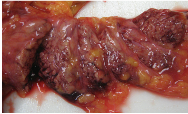
FIG. 1: Inflamed and haemorrhagic pancreas

hypertrophy. Minimal atheroma was noted within the middle segment of the right coronary artery. There was mild peritoneal effusion measuring 150 ml. An inflamed and haemorrhagic pancreas was noted (Figure 1).